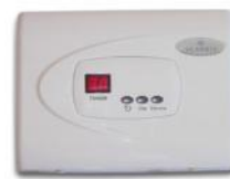
PowerZone Cleaning Systems