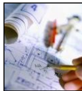
Free Design & Layout services