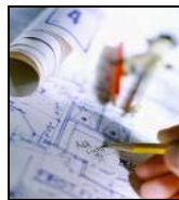
Free Design & Layout services