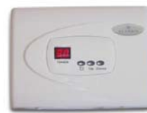
PowerZone Cleaning Systems